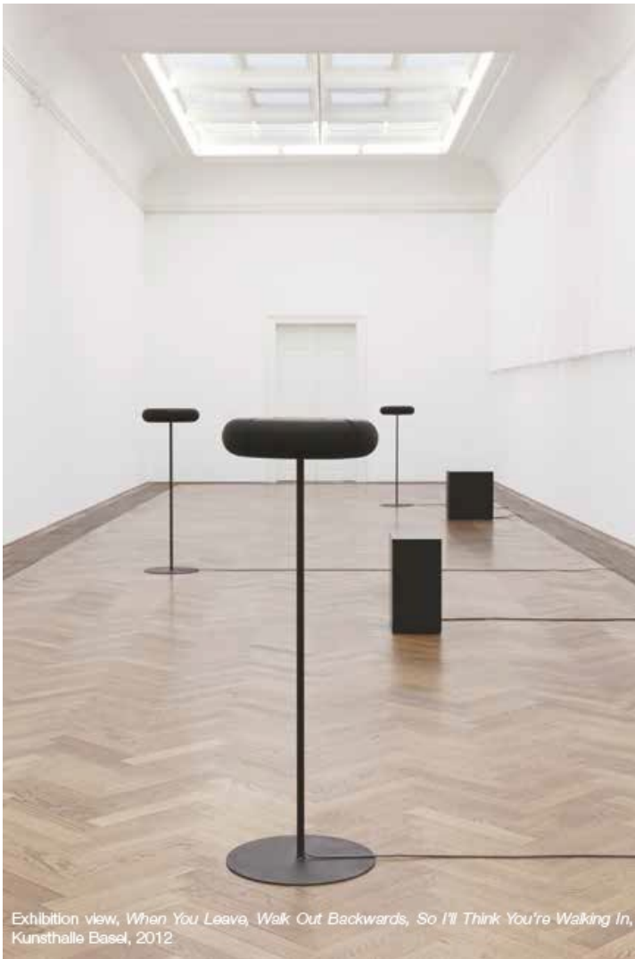
Exhibition view, When You Leave, Walk Out Backwards, So I'll Think You're Walking In, Kunsthalle Basel, 2012