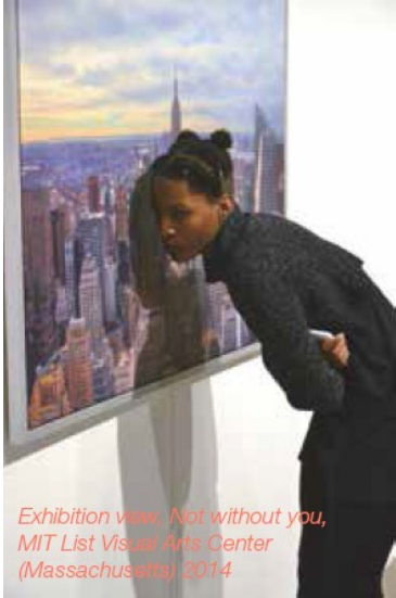
Exhibition view, Not without you, MIT List Visual Arts Center (Massachusetts) 2014