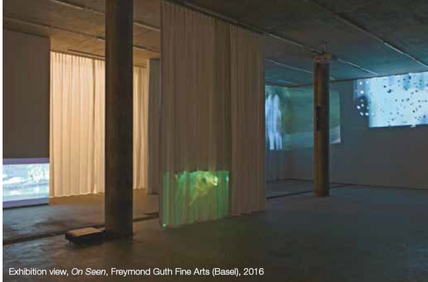
Exhibition view, On Seen, Freyrmund Guth Fine Arts (Basel), 2016