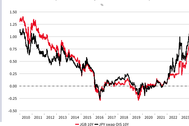
Japan: 10Y JGB yields and 10Y swaps

Past performance should not be seen as a guarantee of future returns.